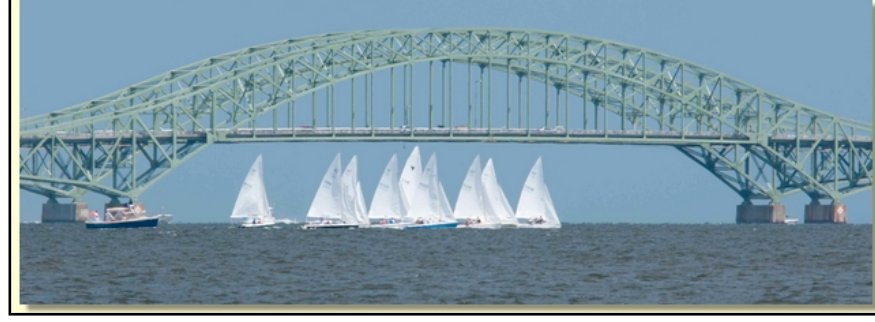
THE FOOT OF EATON LANE WEST ISLIP NEW YORK